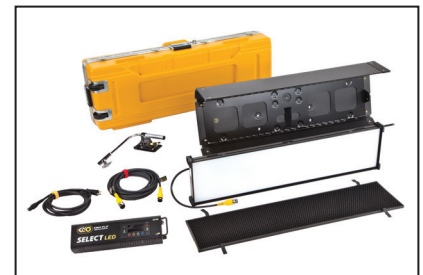
1-Unit Kit w/ Flight Case

Located in Burbank, CA, Kino Flo Lighting Systems was founded in 1987 and is a manufacturer of high quality soft lighting equipment for use in motion picture lighting, TV broadcast, video and photography industries. In 1995 Kino Flo received a technical achievement award from the Academy of Motion Picture Arts and Sciences for the development of color-correct lamps for film.